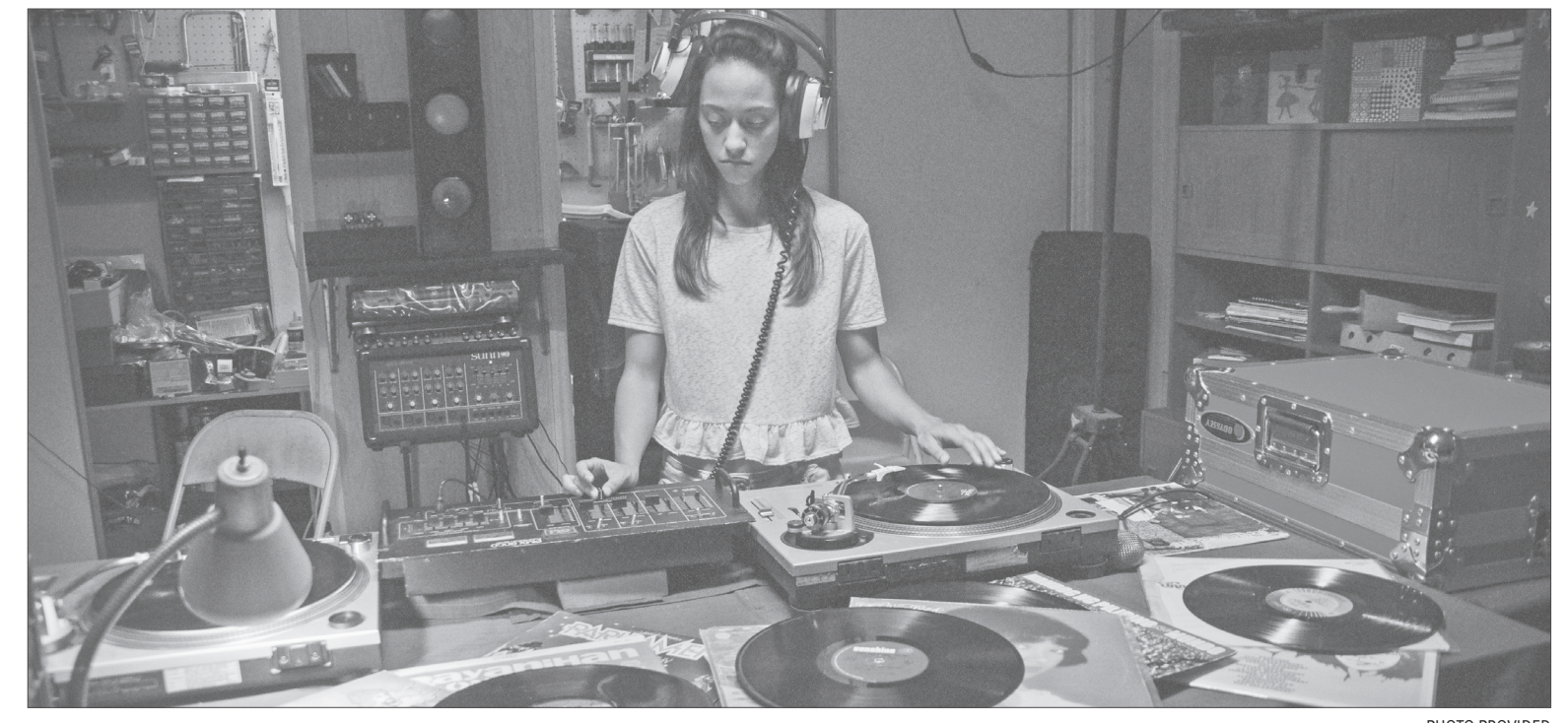
Flip the Record is one of the films screening at LUNAFEST, which will be at The Vic Theatre on Saturday, March 9.

Just in time to honour International Women's Day, LUNAFEST is an evening of short films by, about, and for women. Featuring films by both emerging and award-winning directors, the 2019 lineup focuses on intersectionality, highlighting important stories about women that may not otherwise receive attention.