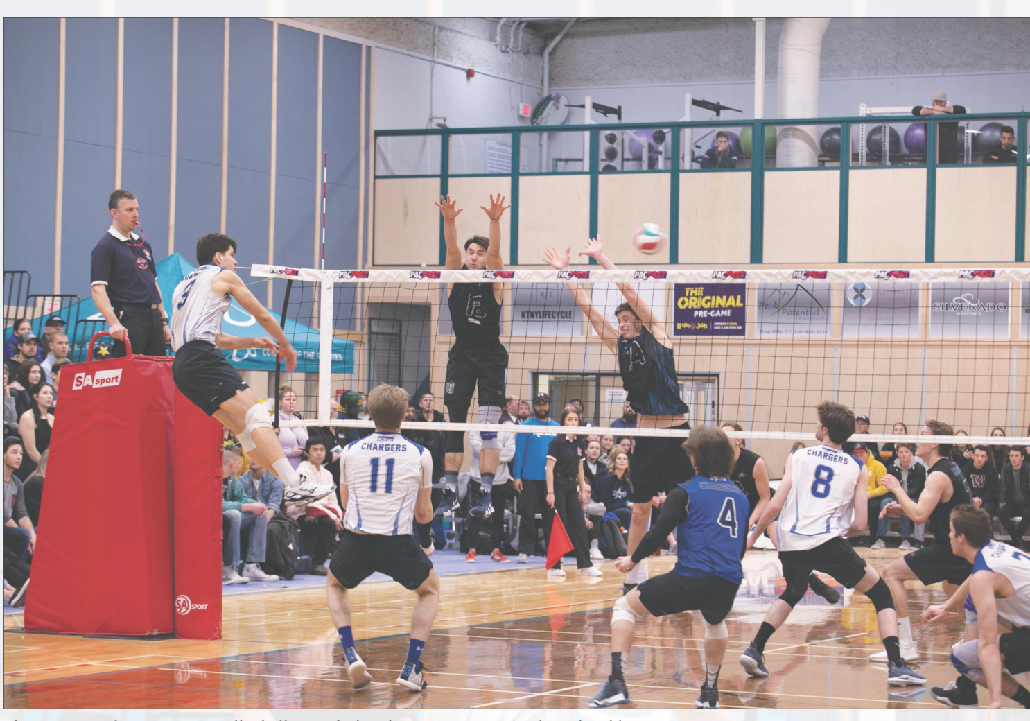
The Camosun Chargers men's volleyball team during the recent PACWEST championships.

valled by the most daunting of all midterms as they stepped onto And none of the teams even had home court advantage.